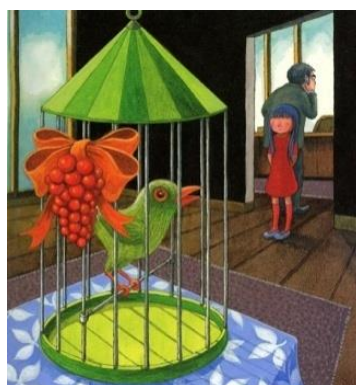
Figure 2: Second sample in ‘The Starry Starry Night’

“I don’t know when to begin; it becomes quite quiet at home” (Jimmy, 2009). The story takes the girl as the first-person narrative. Unconsciously, her family became stranger without interaction and without concern. The symbolic objects are a lot in the first sample. From the people’s expression, behavior, and the tone, scene, and other accessories of the picture, the pattern gives the sense of alienation, which shows the consistent results between the pretest and the posttest.