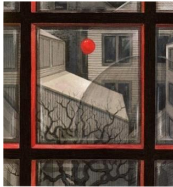
Figure 3: Third sample in ‘The Starry Starry Night’

“Daddy is always talking on the phone. It seems that each his phone call is important. Anyway, I have nothing to talk to him. Probably, he doesn’t know what to talk to me, either” (Jimmy, 2009). The girl’s father is always busy in his business. While giving his-considered good gifts or items to his daughter, he ignores that the most essential thing is to communicate with his child. In the second sample, it can express the girl’s loneliness, desire for free, and the poor relationship with parents through the symbolic colors. Therefore, the analysis result of pretest is consistent with the posttest.