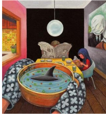
Figure 1: First sample in ‘The Starry Starry Night’