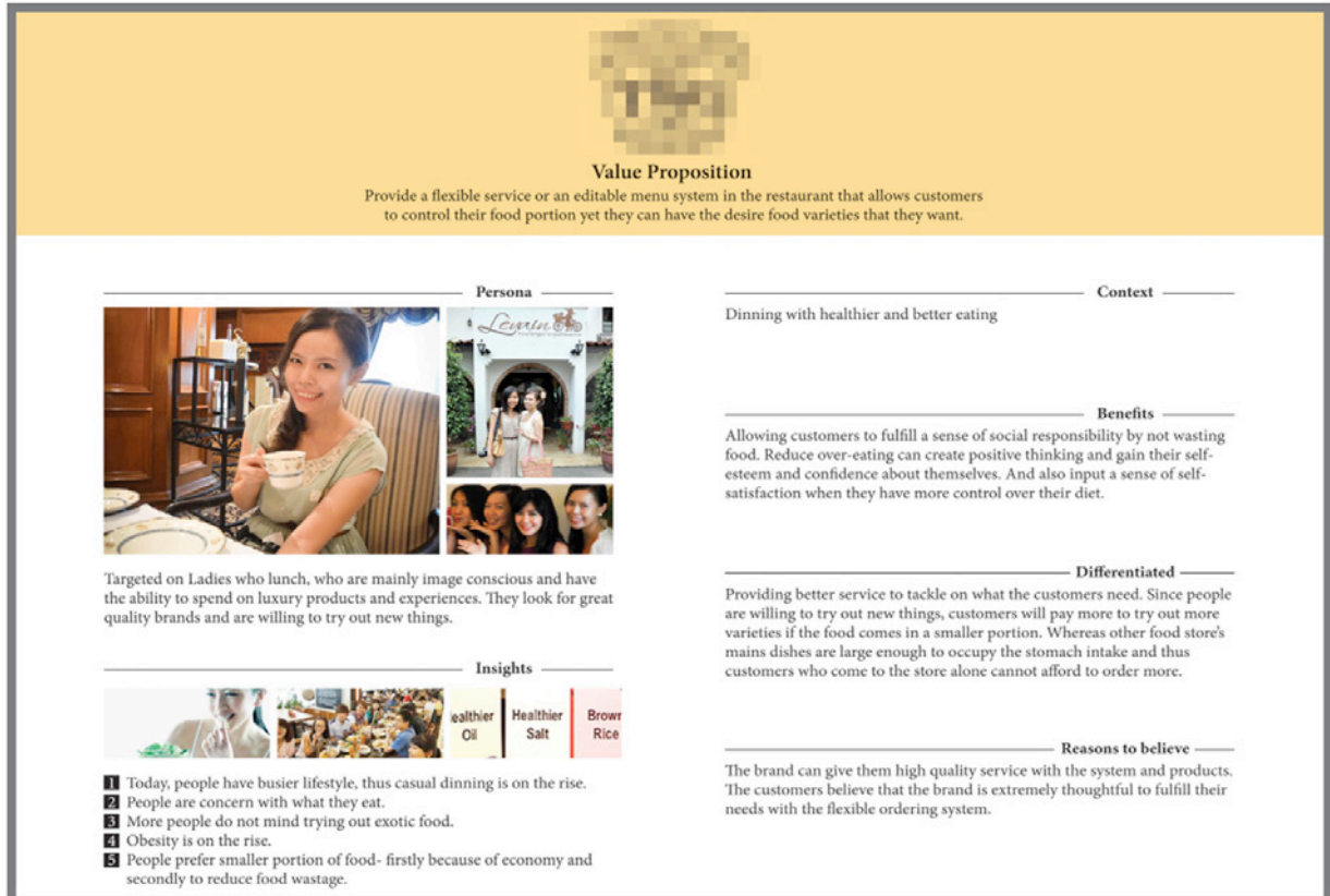
Figure.3 Example of student-generated Value Proposition board