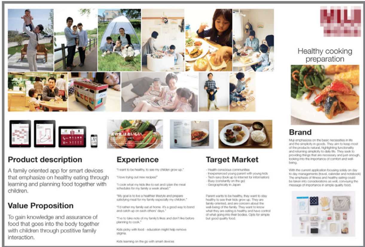
Figure.2 Example of student-generated Value Proposition board